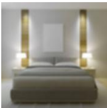
3000k (Soft White)