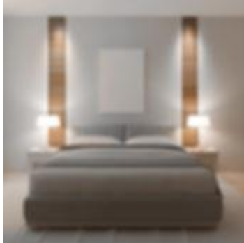
2700k (Warm White)